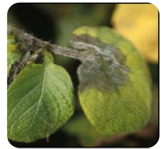
Visual effects of late blight disease.

This year a selected number of transformations were then grown in confined field trails. These trials provide insight into how the modified plants will perform in the field under conditions that are ripe for late blight. Further studies are required in the development of our products and we will be completing them in the upcoming years. For example, additional molecular characterizations will be performed on the selected transformations. These characterizations identify the difference between the genetically modified plant and its conventional counterpart. This characterization confirms that the transformation occurred as intended. Additional field trials and product safety testing will be completed to ensure environmental and human well-being.