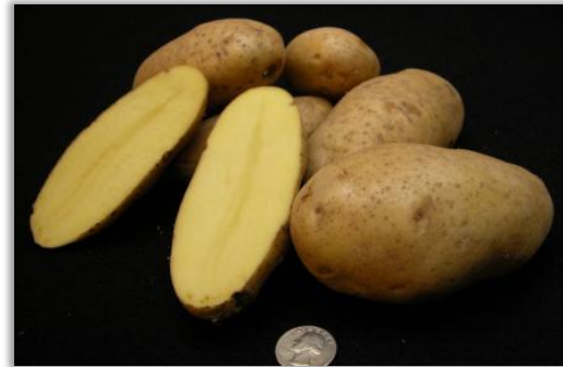
Product safety evaluations

During this fiscal year, the technical team focused on four potato events: