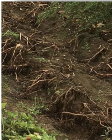
Non-transgenic Atlantic variety plants devastated by Late Blight.

This photo shows two rows (on right and left) of non-transgenic Atlantic variety plants completely succumbed to Late Blight. The center four rows show the 3R-gene potato completely resistant. The affected plants in the middle of this section are the single gene potato which showed little to no resistance.