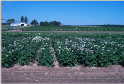
Confined Field Trials