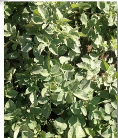
3R-gene plants showing high level of resistance to Late Blight.