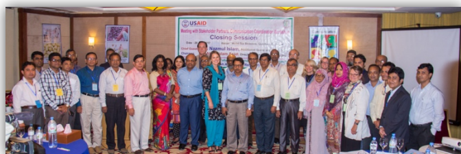
Communications Workshop, Dhaka, Bangladesh

Effective communications, advocacy and strategic partnerships among active players in communicating biotech products are crucial to the ultimate success of the project. Acceptance of biotech products by farmers and consumers, along with a positive media environment for all USAID Feed the Future agriculture biotechnology products is a shared goal. In support of this goal, a strategic communications alliance between the Partnership; Cornell's Alliance for Science, which supports the transgenic Bt brinjal project in Bangladesh; and Seed Stories, private sector communications company; was established.