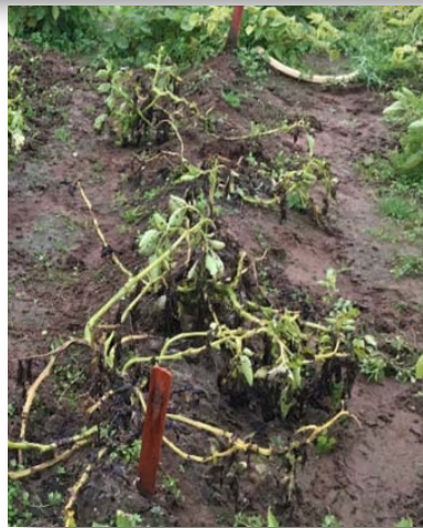
Single gene plants showing a serious infection of Late Blight.